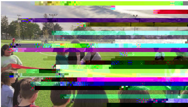
Figure 1: Unveiling Daystrom Public School's new artificial field.